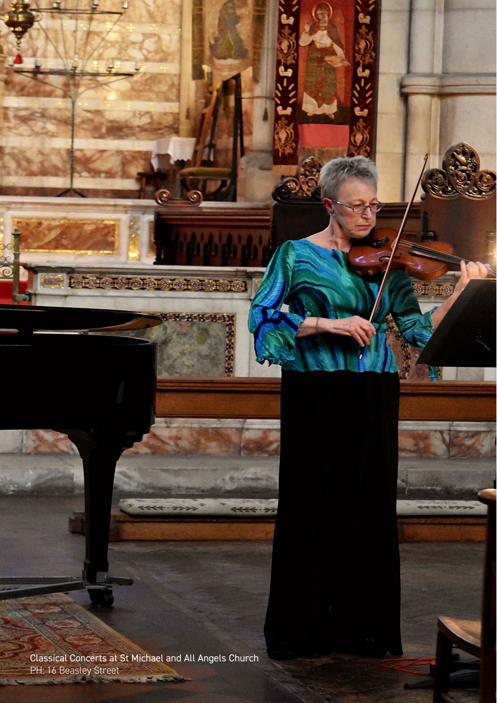
Classical Concerts at St Michael and All Angels Church PH: 16 Beasley Street