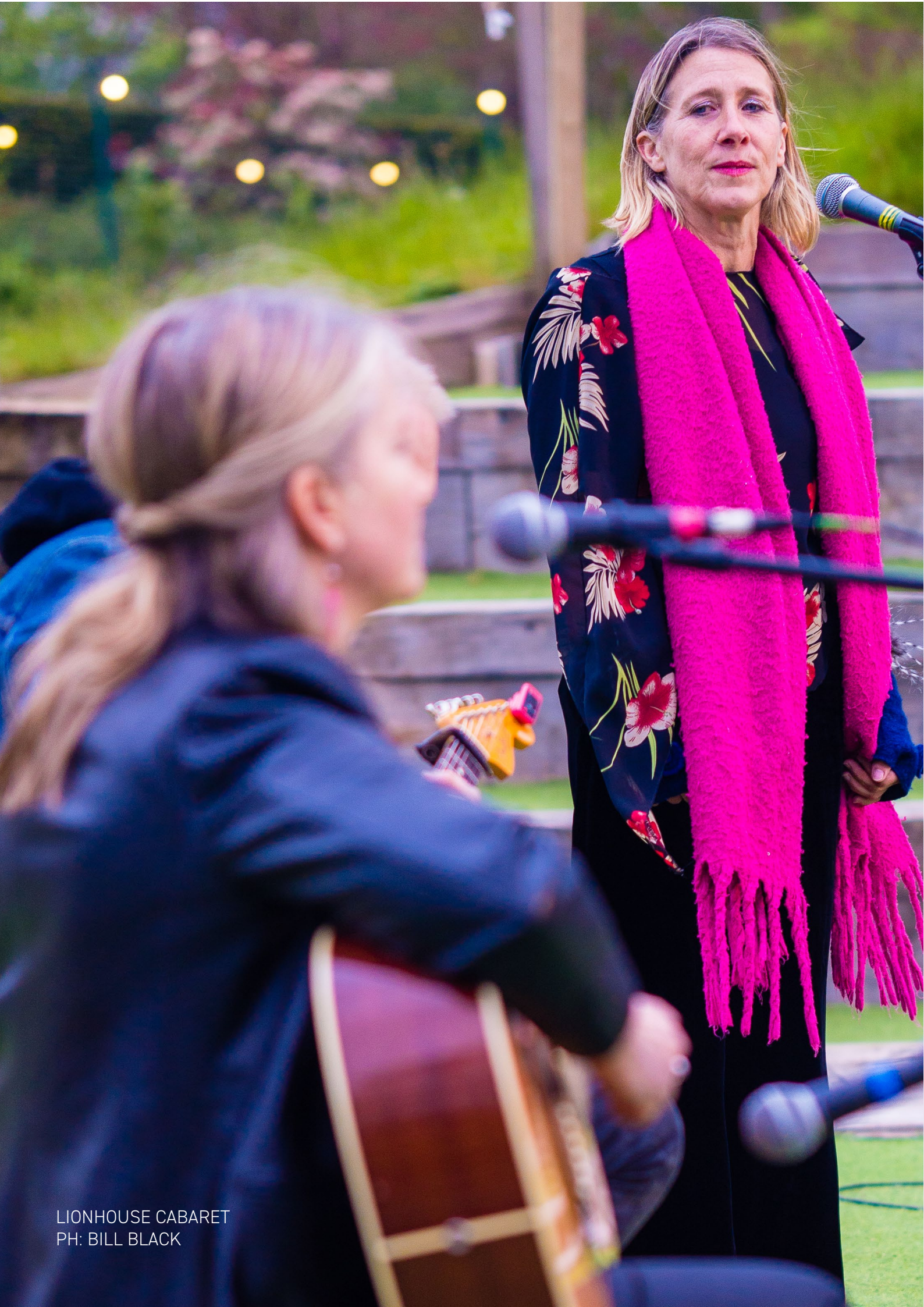
LIONHOUSE CABARET