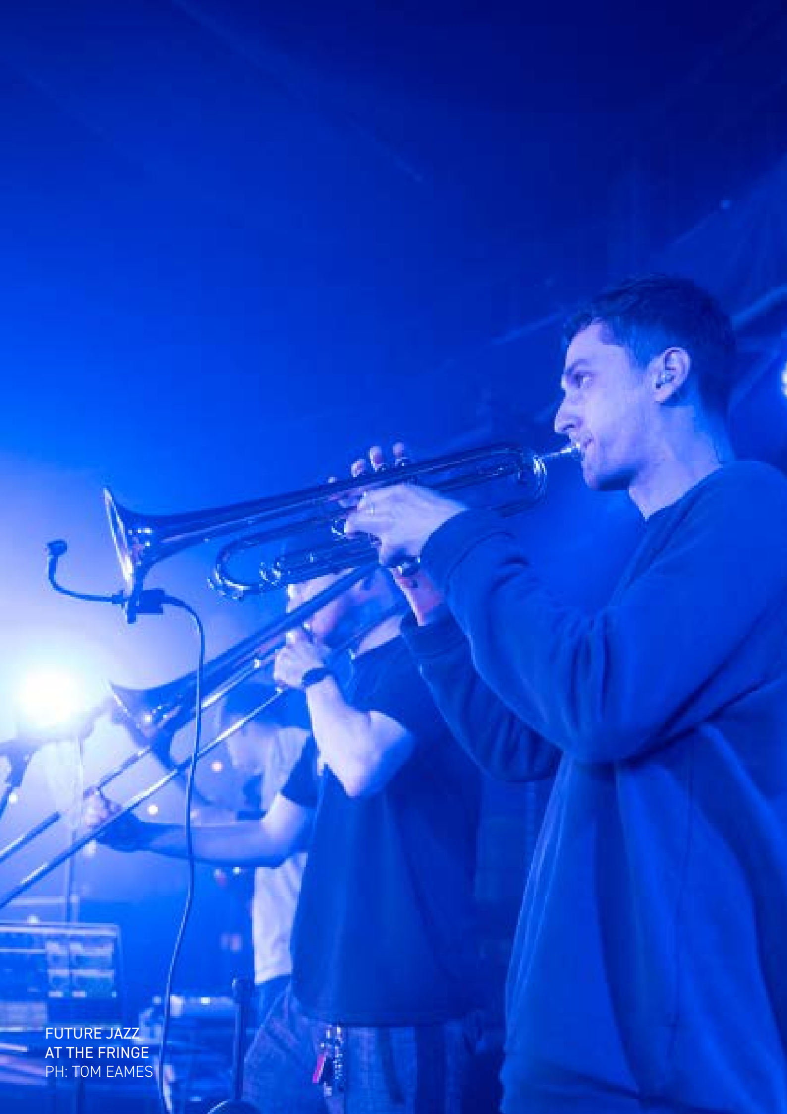
FUTURE JAZZ AT THE FRINGE