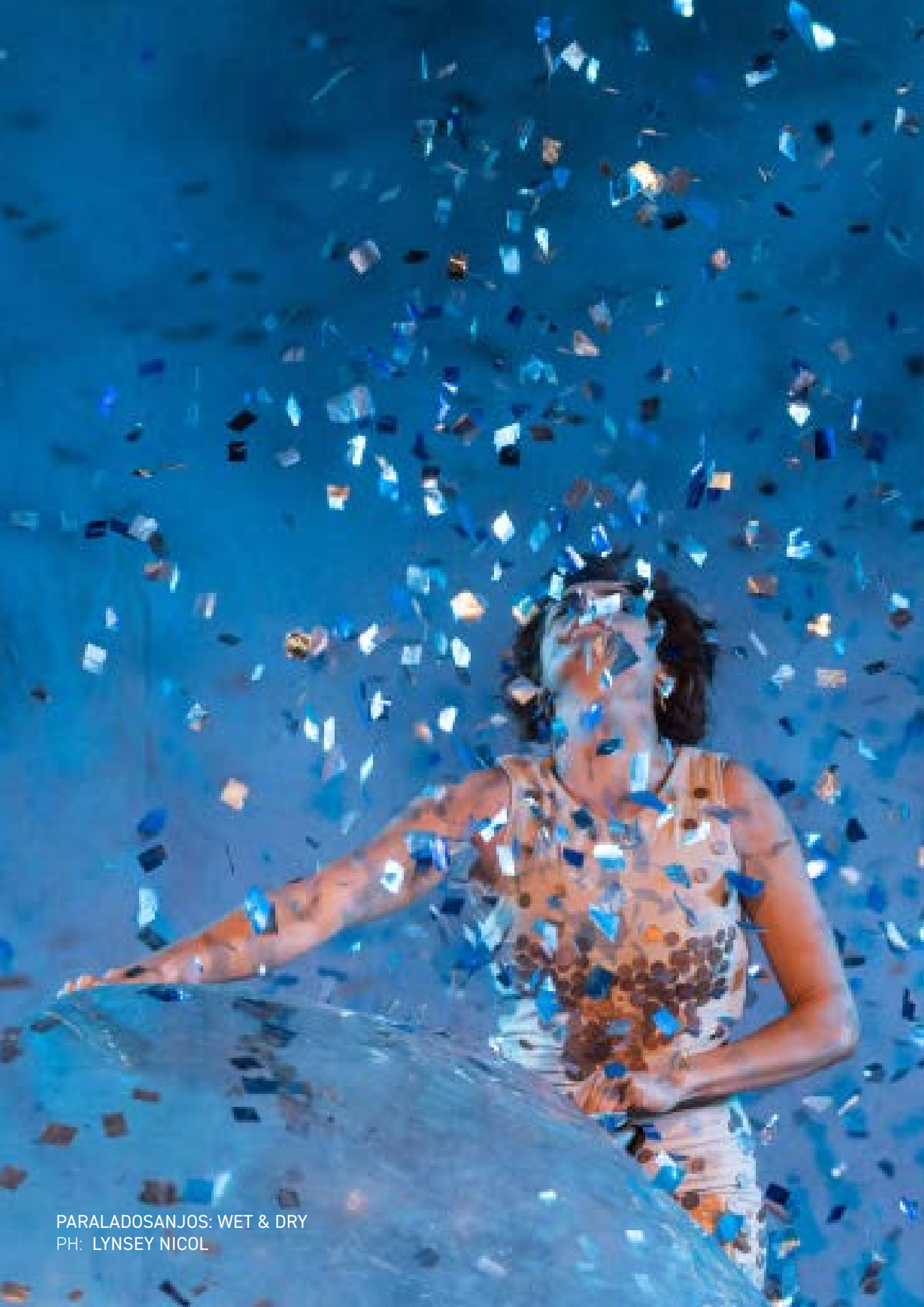
PARALADOSANJOS: WET & DRY