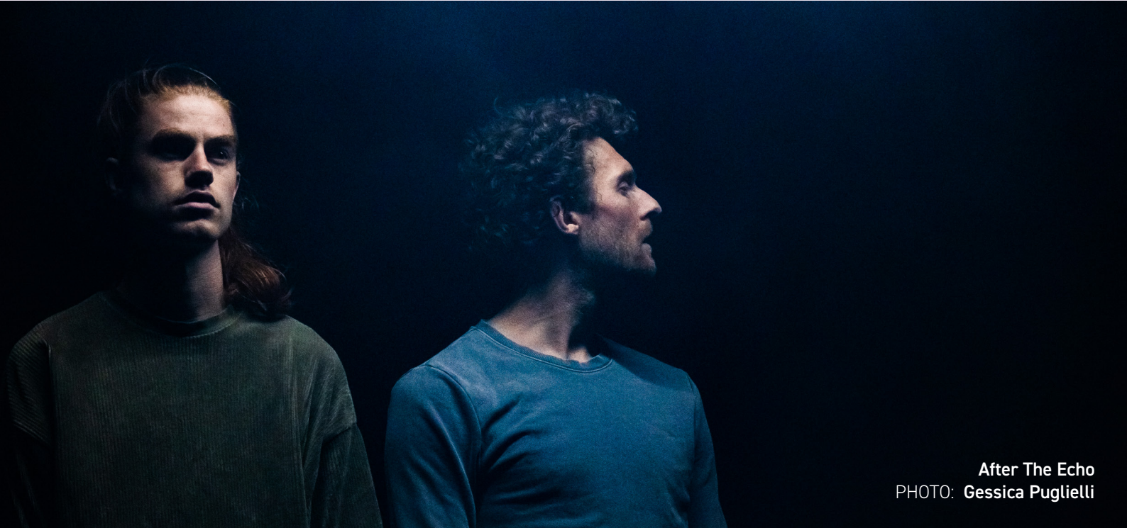
After The Echo