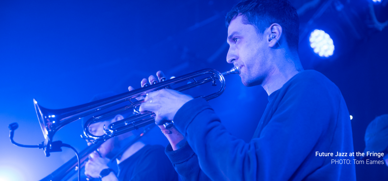
Future Jazz at the Fringe