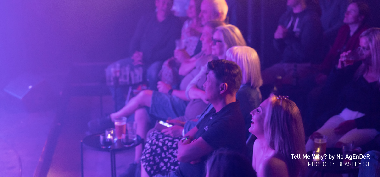
Tell Me Why? by No AgEnDeR