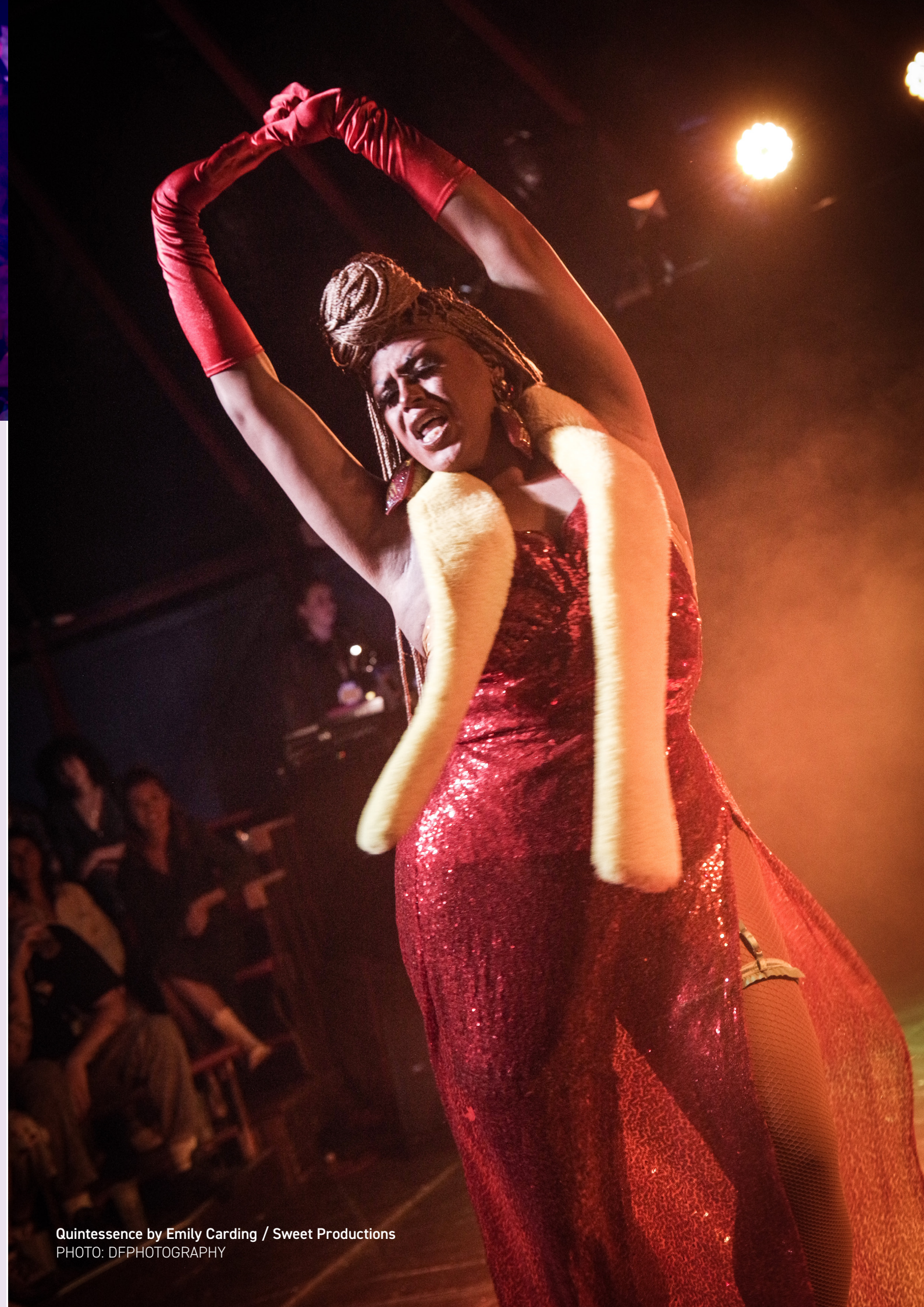
Quintessence by Emily Carding / Sweet Productions